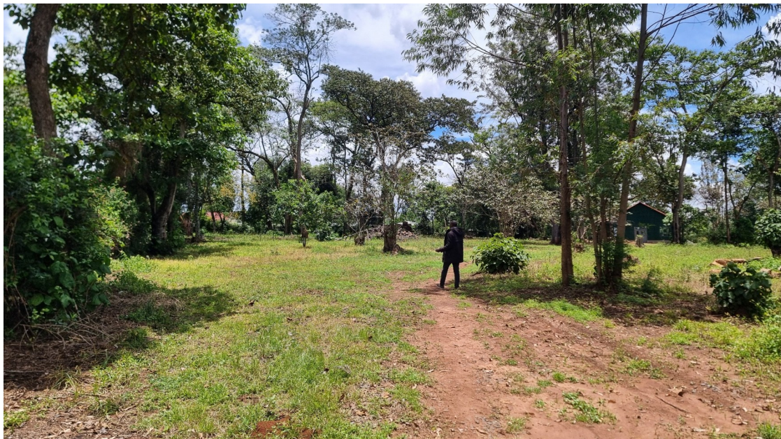
Mt. Horeb grounds - future gardens, prayer trails, gazebos, and retreat spaces.

We believe the mountain will be an altar of encounter and service - a place where prayer rises and people are strengthened.