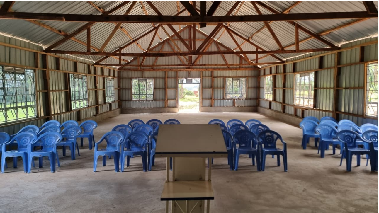
Inside the current sanctuary - the Water Project will support worship, retreats, dormitories, gardens, and community service.

This project is prayer in action. It is ministry touching the body and the soul. It is the House of God becoming a blessing to the community around it.